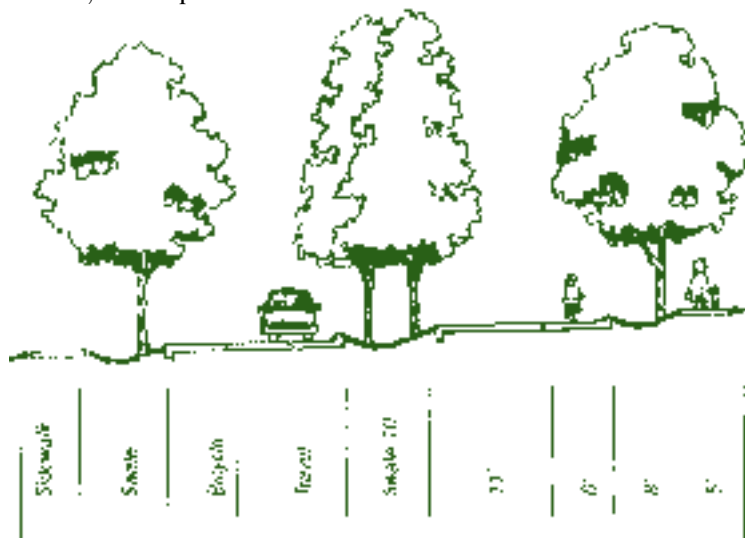
Incorporate stormwater treatment into street design by adding trees and swales. From Green Neighborhoods, a publication of NeighborhoodLAB, http://neighborhood.uoregon.edu/ .

Xiao, Q. F., et. al. 1998. Rainfall interception by Sacramento's urban forest. J. Arbor. 24(4): 235-244.